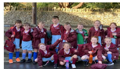
Some U9s took part in a football competition this week, they were all fabulous and the boys reached the semi final. Well done all and thankyou parents for your support.